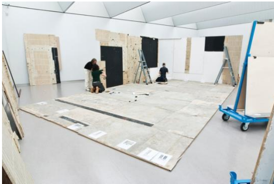
During the installation of Franz West's Clamp (1995) in 2012, with the walls papered with pages from old telephone directories, now showing part of the work's history.

For the curator, the following dilemma may arise. Should the work always be displayed in its entirety when it is set up, or would a selection of the components suffice, and if so, which components? In early presentations, one of the user functions was to make telephone calls with a landline telephone. This telephone was not included in later presentations. Was this based on a direct instruction from the artist, or motivated by technological developments – or both?